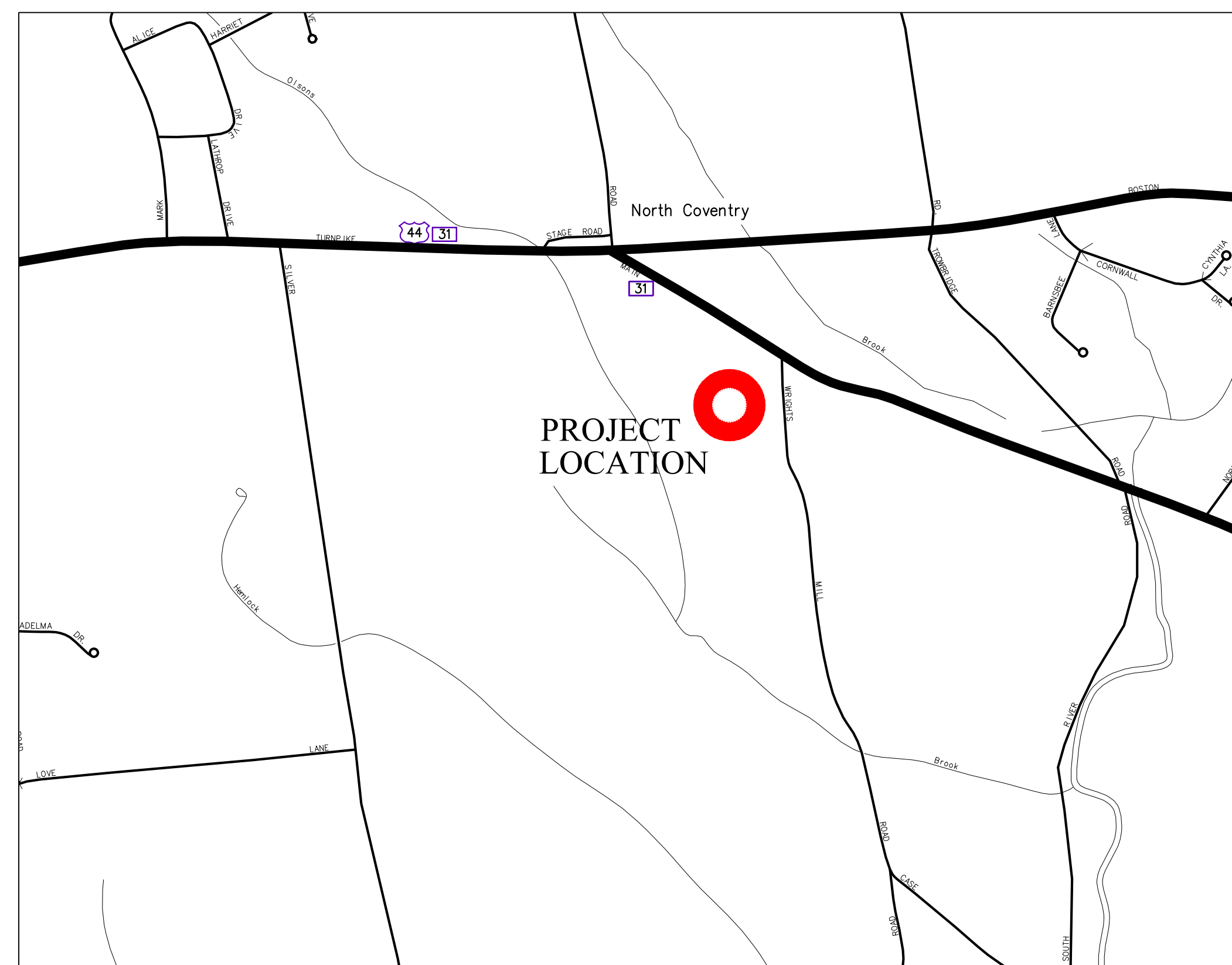
LOCATION MAP SCALE: 1"=1000'

DESIGNED BY: TOWN OF COVENTRY ENGINEERING DEPARTMENT 1712 MAIN STREET ~ COVENTRY, CT 06238 (860) 742-4062